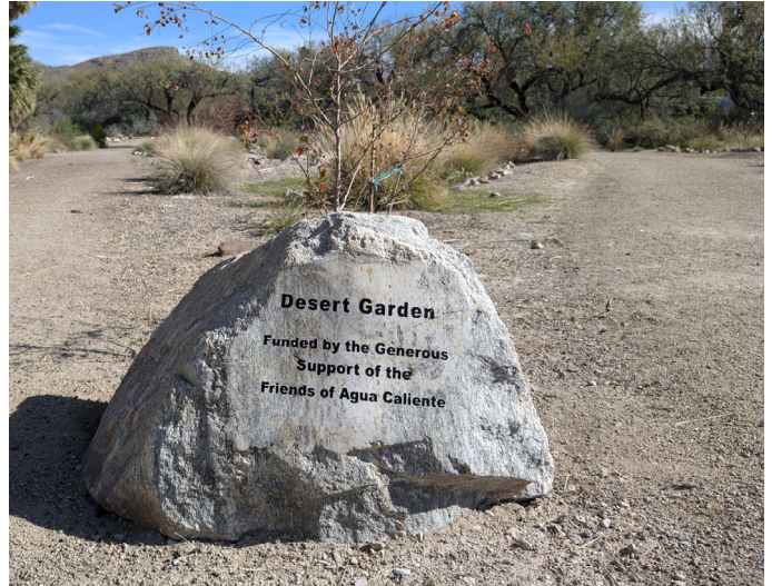
Desert Garden Dedication Sign