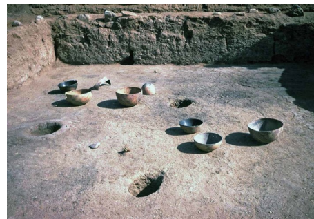
After placing pottery vessels on the floor of this house, the Hohokam burned the house as part of an abandonment ritual.

lated that incursions by other more hostile people may have driven them