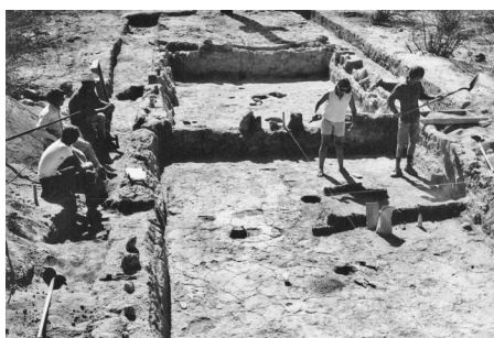
Whiptail Ruin excavations in the 1960s

Published data indicates that around 0-700 AD the Hohokam began to establish settlements in the area. Archeological digs found evidence of habitation and use