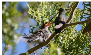
Hummingbird feeding chick

er kit. As part of Tucson Audubon's Year of the Hummingbird , we've