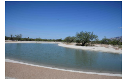
Agua Caliente Park Pond 2