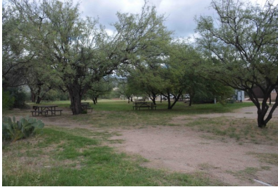
NE Corner of Park, near Brown Bunkhouse

The Friends have been working with Pima County NRPR on the design of a nature and birding trail to better utilize the northeast section of the park. Currently, there are very few amenities in that area and it is popular for birds to hang out and nest. The