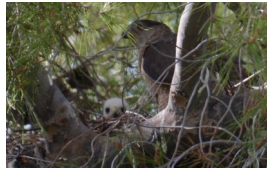
Cooper Hawk & Chick

now, that portion is on hold until the design is worked out to minimize digging of footings and other soil disruption. There is a