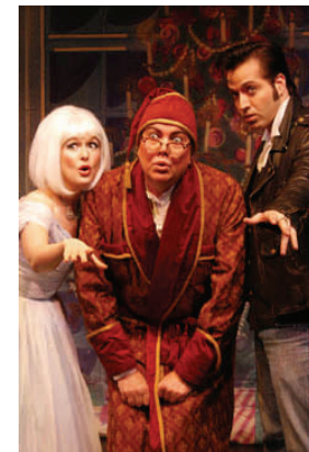
The Cast of Scrooge

Yes, the Holidays will soon be upon us. Your chance to enjoy them Tucson style and benefit the Friends of Agua Caliente is also here. Scrooge—A Gaslight Musical is our Holiday fundraiser this year and should keep us all laughing and singing right through to January. Come to The Gaslight Theatre production on Wednesday, December 12 at 8:30 PM. You can boo and hiss with the rest of us in the best of melodrama fashion. All seats are reserved in the first three rows of the theater which means the actors can't miss our responses to their antics and we are in the midst of the action. Reservations will be on a first come/first served basis. Your check is your reservation so sign up before the best seats are taken. See the included flyer for all the details.