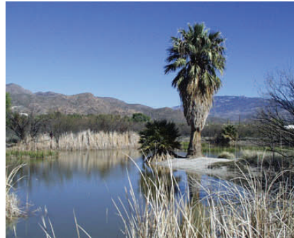
Agua Caliente Pond 2 June 2003