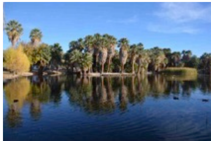
Main Pond (June 2013)

Pete Filiatrault The ghost of Agua Caliente