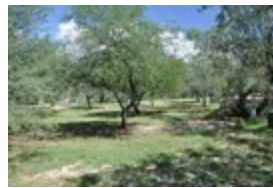
Agua Caliente Park North

In support of the Park, we plan to prepare a design for a small contemplative garden on the north side. This would be presented to grantors for funding after approval by Pima County NRPR.