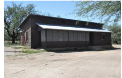
The Bunkhouse gets a screened-in addition